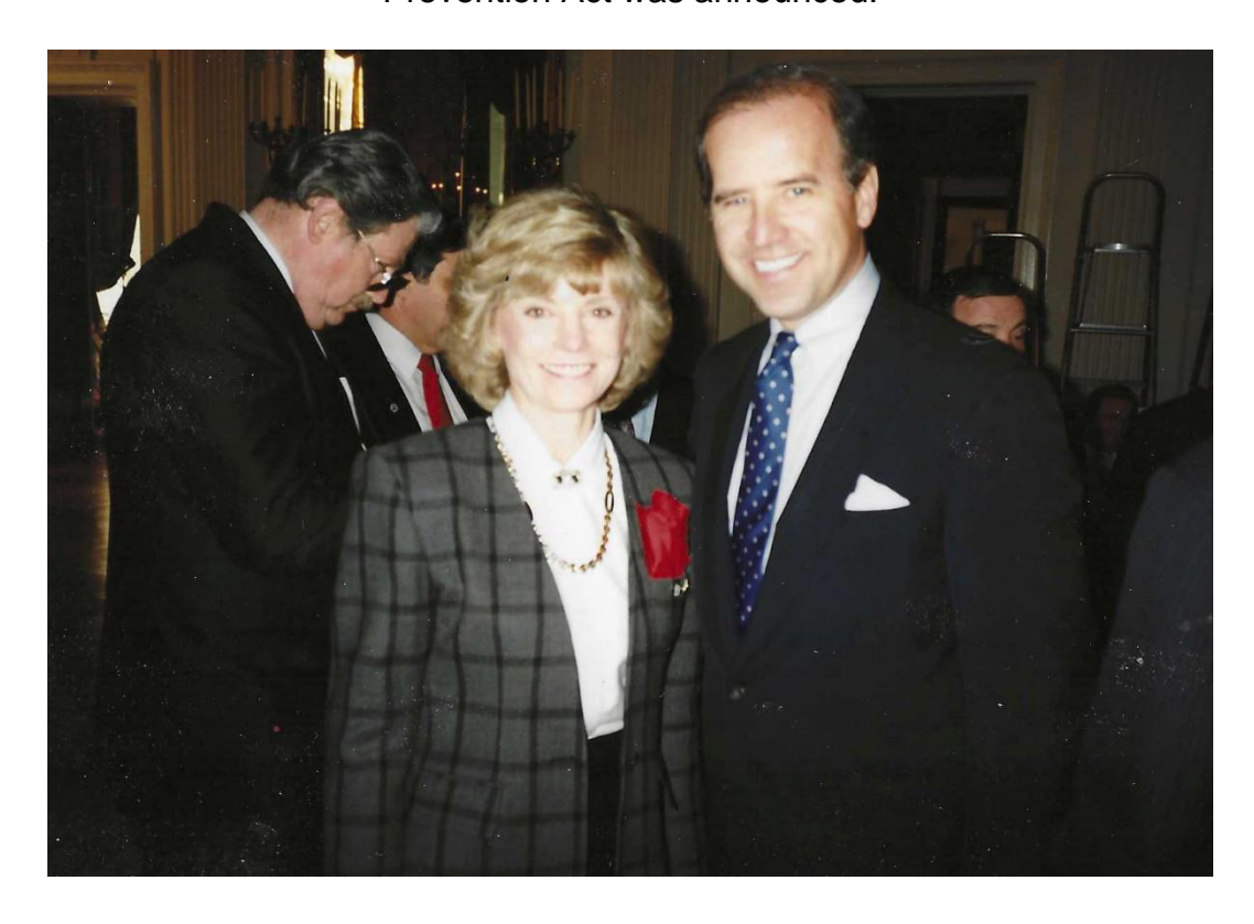
Senator Joe Biden, Commissioner Deanne Tilton Durfee

* Photo taken in the East Room of the White House when the Child Pornography Prevention Act was announced.